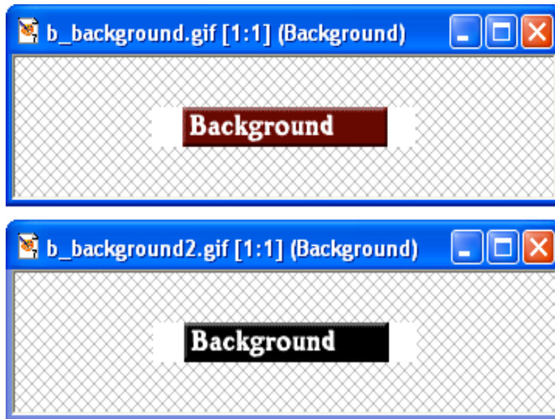
A regular button and a "current page" version of the button

note The black version of the button displays when the linked page is the active page. This visual cue enables viewers to look at the navigation bar and quickly identify which page they are currently viewing